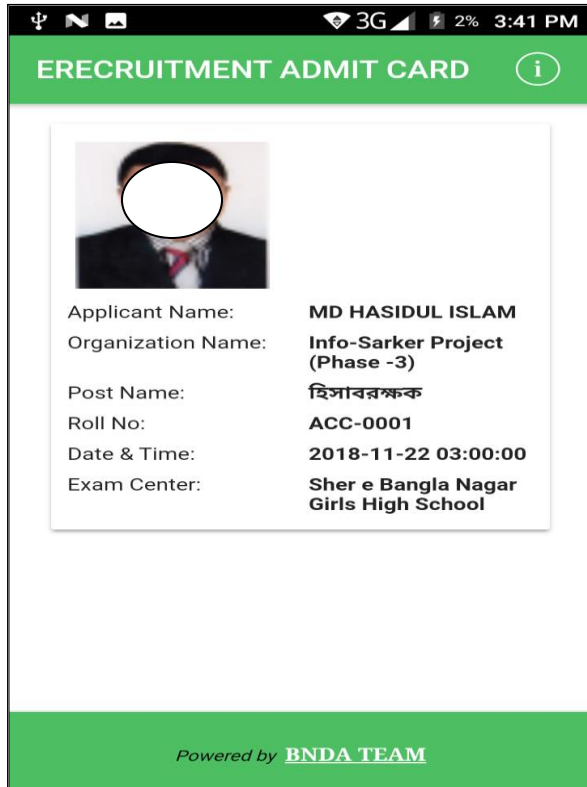
View Admit Card From DLS Platform